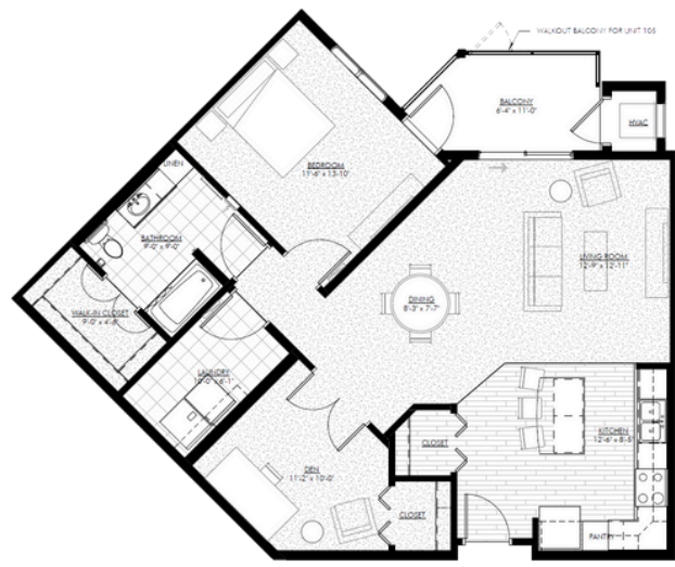
Birch • 1 BD + Den, 1 BA - 1,138 SF WAITLIST AVAILABLE