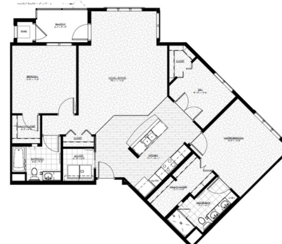
Sycamore • 2 BD + Den, 2 BA - 1,535 SF WAITLIST AVAILABLE