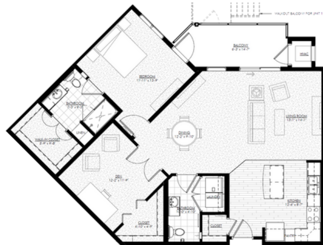
Laurel • 1 BD + Den, 1.5 BA - 1,258 SF WAITLIST AVAILABLE