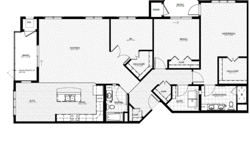
Hickory • 2 BD + Den, 2 BA - 1,949 SF WAITLIST AVAILABLE

Share Value Range: $145,000 - $495,000 Monthly Fee Range: $1,320 - $3,680