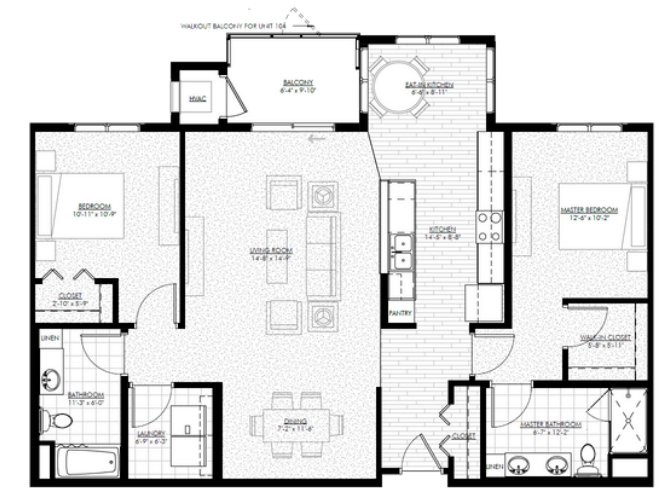
Maple • 2 BD, 2 BA - 1,389 SF WAITLIST AVAILABLE