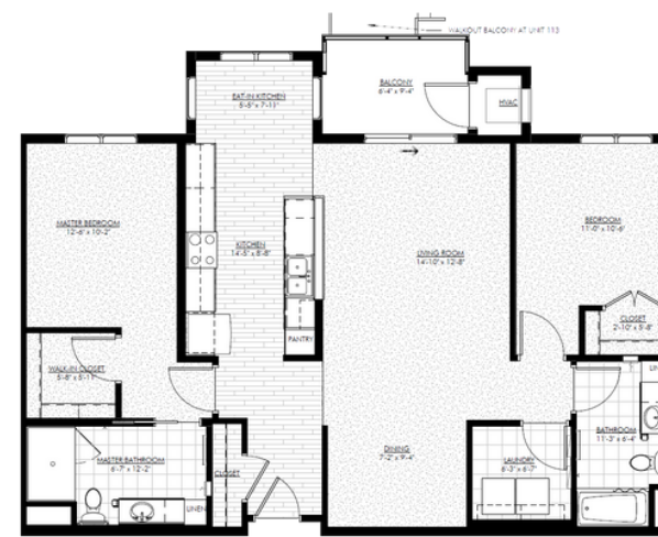
Myrtle • 2 BD, 2 BA - 1,310 SF WAITLIST AVAILABLE