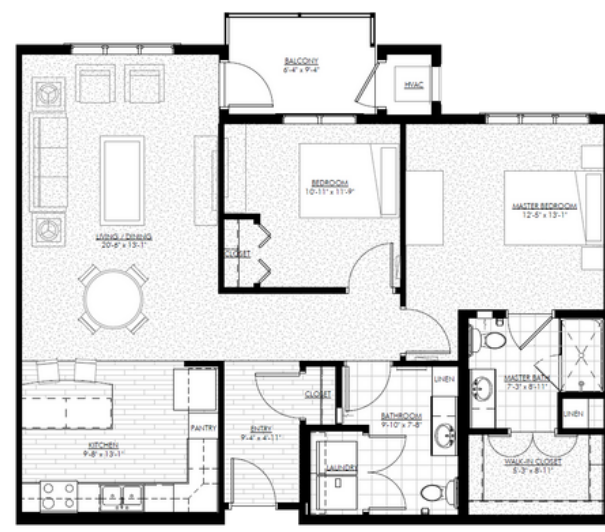
Linden • 1 BD + Den, 1.5 BA - 1,185 SF WAITLIST AVAILABLE