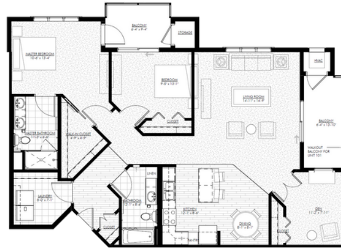
Sumac • 2 BD + Den, 2 BA - 1,513 SF WAITLIST AVAILABLE