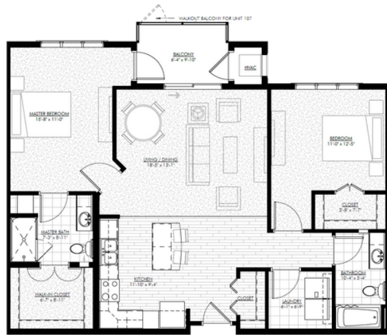
Tamarack • 2 BD, 2 BA - 1,240 SF WAITLIST AVAILABLE