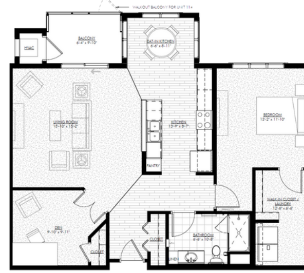
Chestnut • 1 BD + Den, 1 BA - 1,188 SF WAITLIST AVAILABLE